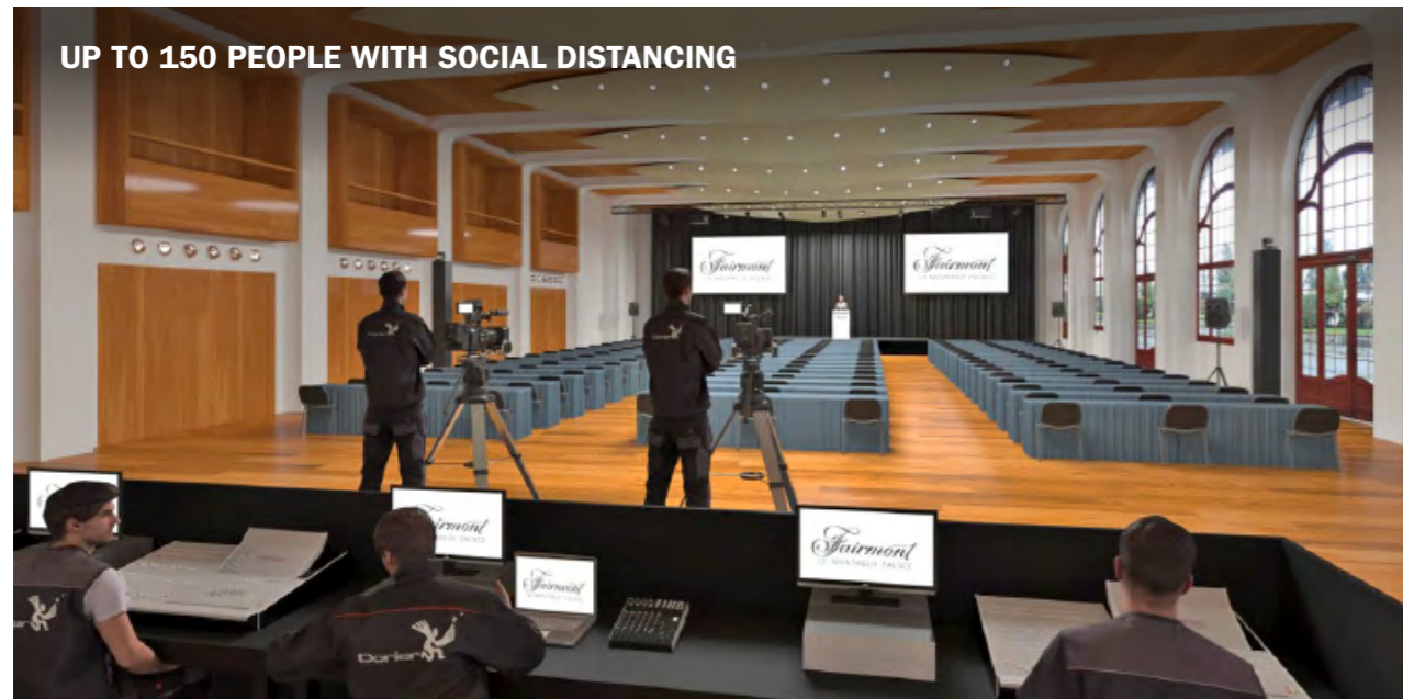
CLASSROOM SETUP LÉMAN AB

Two-way audio + video interaction between on-site and remote participants, including: