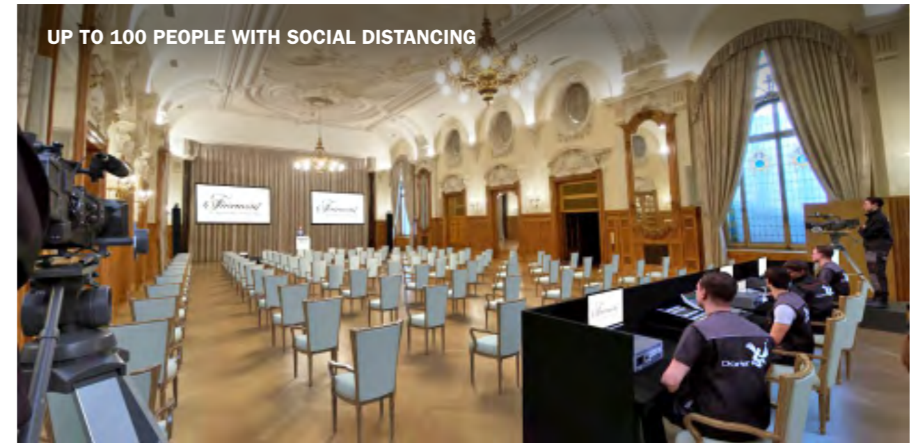
THEATER SETUP SALLE DES CONGRÈS

Two-way audio + video interaction between on-site and remote participants, including: