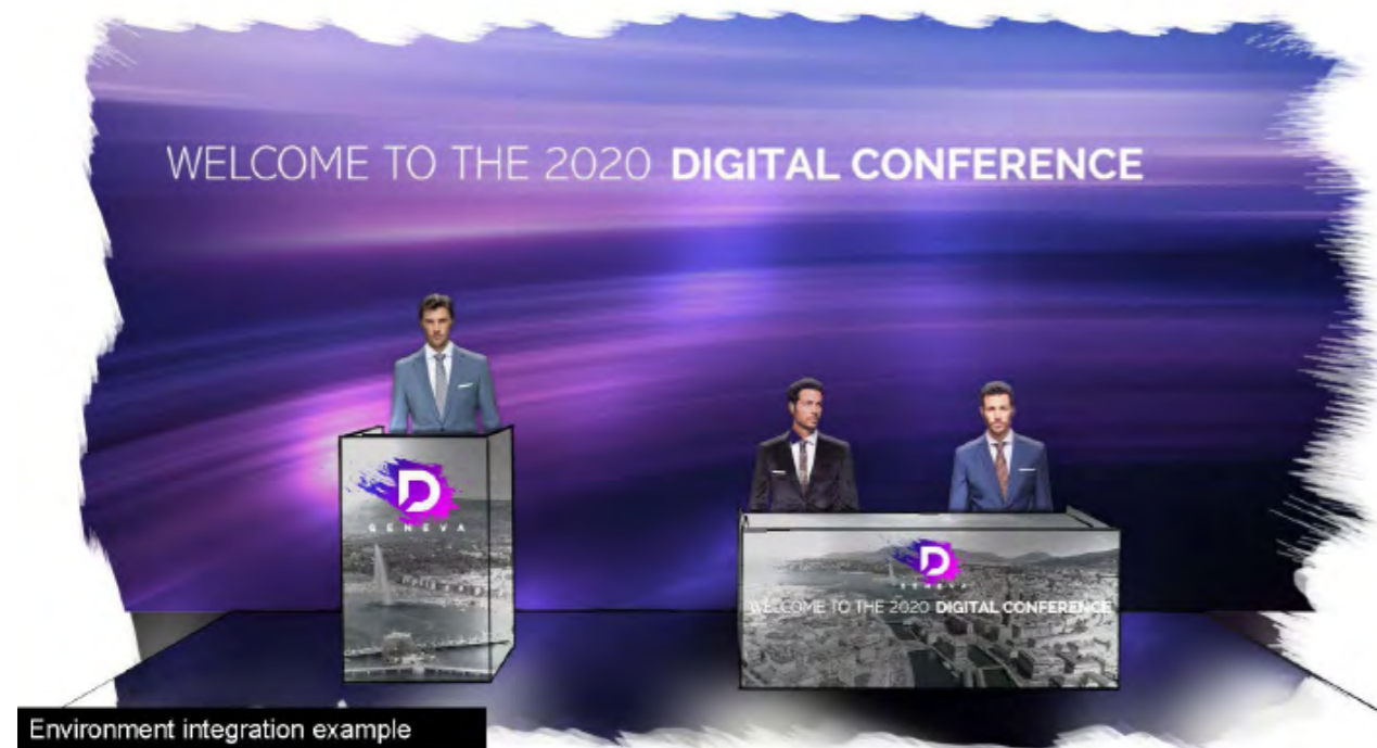
Environment integration example

Host your panel discussion, conference, live event and meetings with any background and furniture design. There is no limit to your creativity! This full virtual studio environment allows you to showcase your brand identity while entertaining your audience. The perfect way to host an event for a worldwide community and attendees.