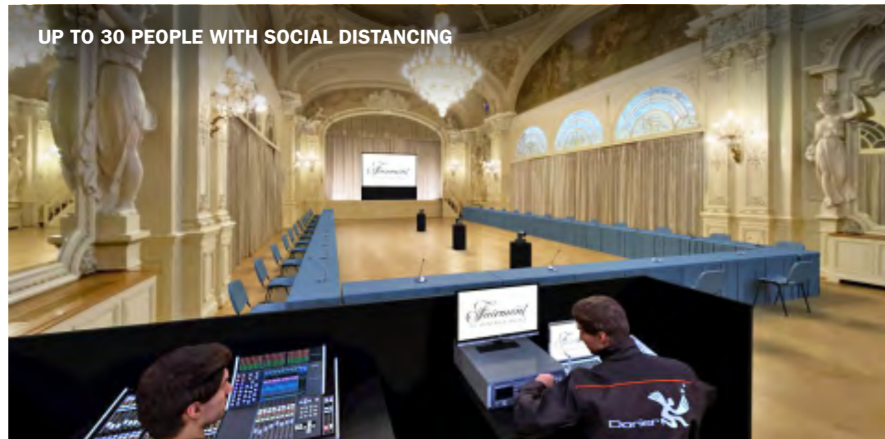
U-SHAPE SET UP SALLE DES FÊTES

Two-way audio + video interaction between physical and remote participants, including: