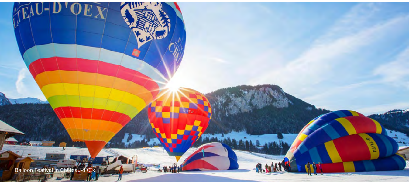
Balloon Festival in Chateau-d'Oex