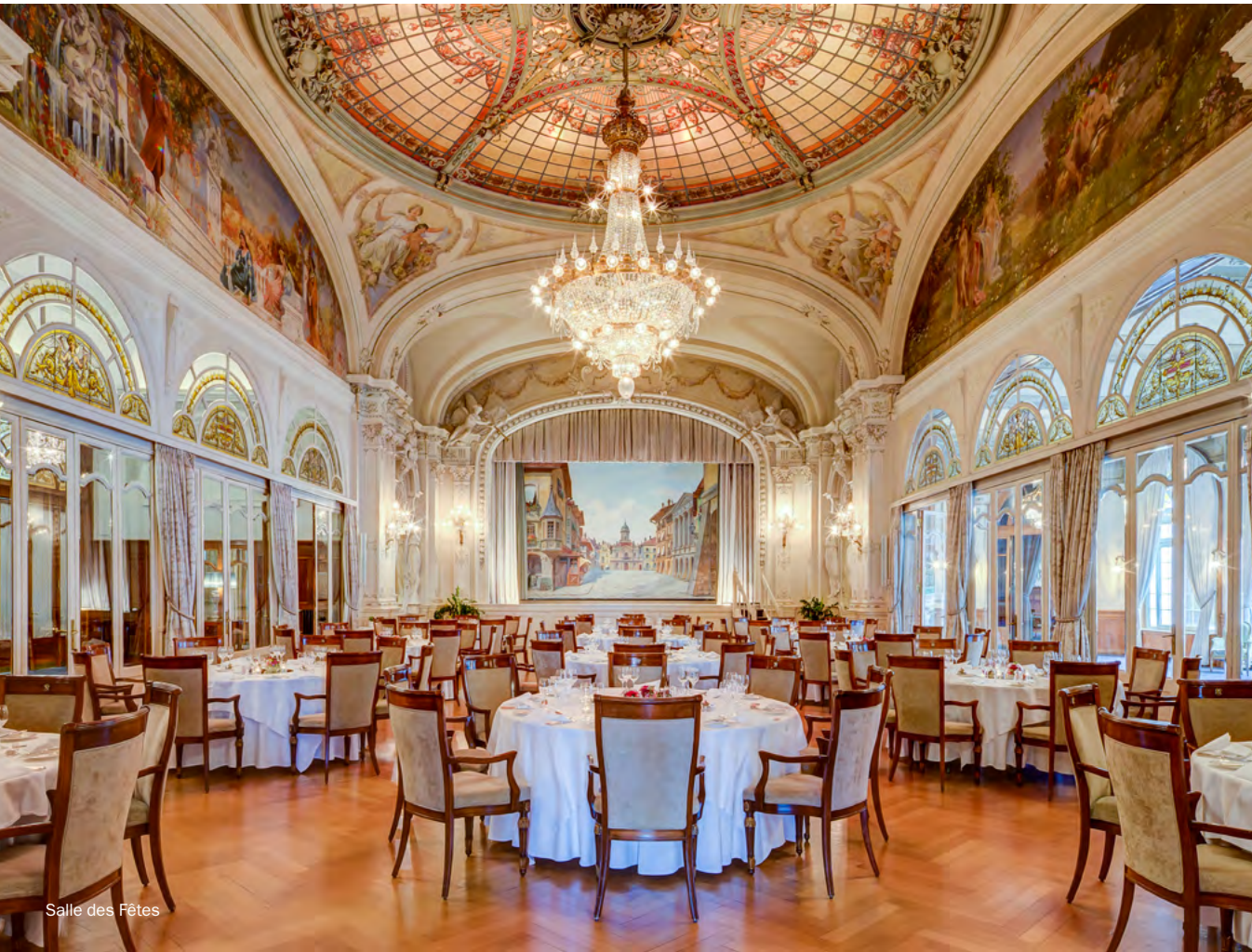
Salle des Fêtes

Our team of professional event experts stands ready to tie everything together. They'll work with you to determine everything from seating arrangements and refreshment breaks to off-site catering and incentive activities while enjoying refined accommodation and amenities. We also provide state-of-the-art technology support through our supplier, Dorier, to help make sure that every one of your guests can enjoy the programme of the day. You'll no doubt have all sorts of other tasks to attend to during the event—leave worrying about the details to us.