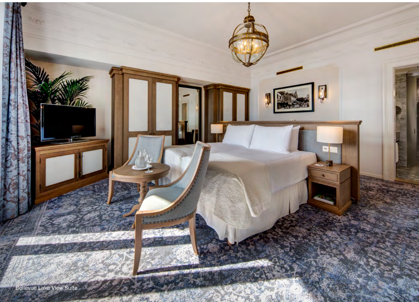
Bellevue Lake View Suite