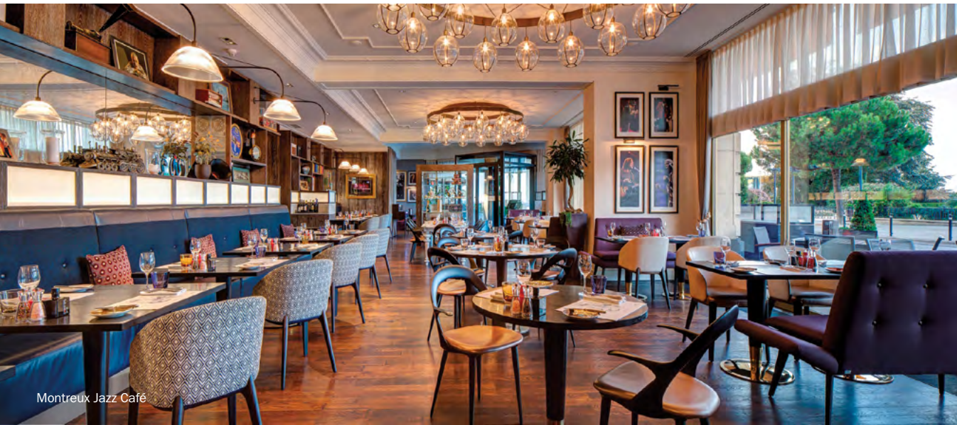
Montreux Jazz Café