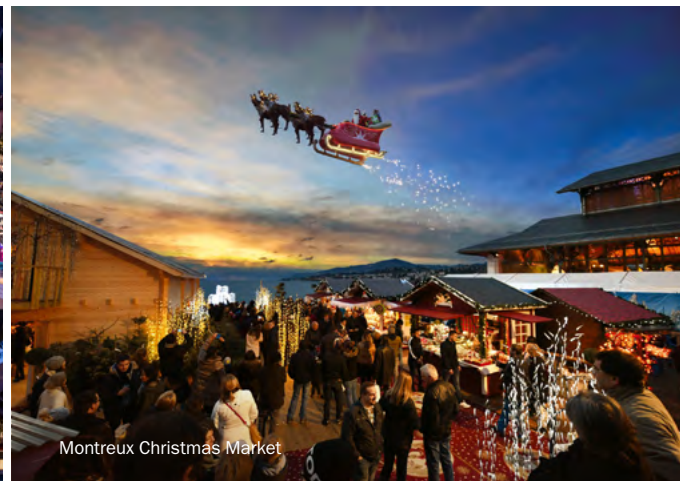
Montreux Christmas Market