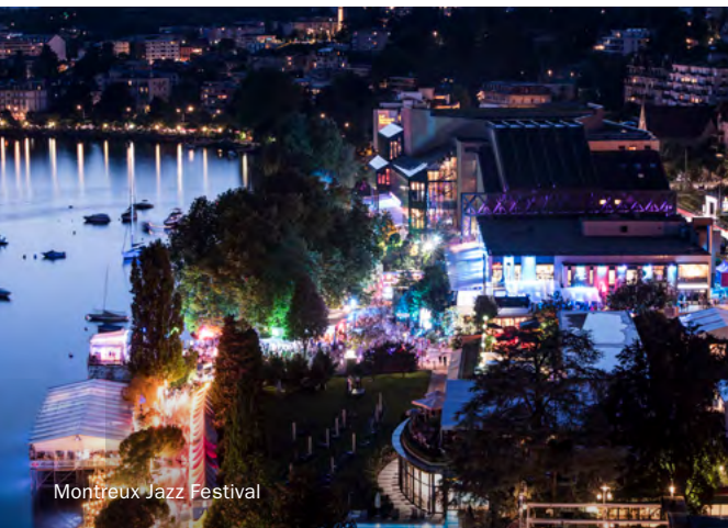
Montreux Jazz Festival

Across the wild gorges of Vanel and Gêrignoz, you will find a 15-kilometre (9.3-mile) rafting course that's regarded as one of the most beautiful in Switzerland. Visitors can also make use of the canyoning, canoe-kayaking and hydrospeed (whitewater sledging/river boarding) facilities.