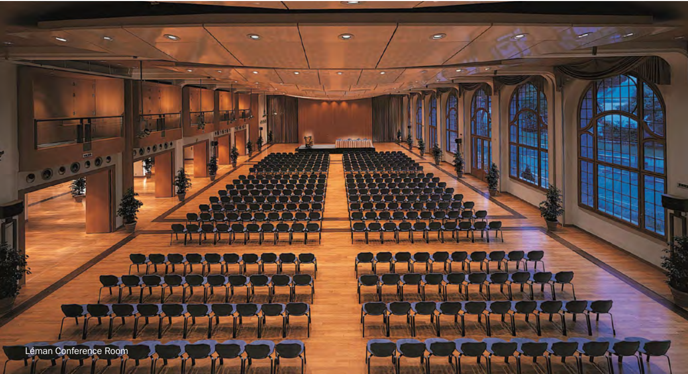
Léman Conference Room