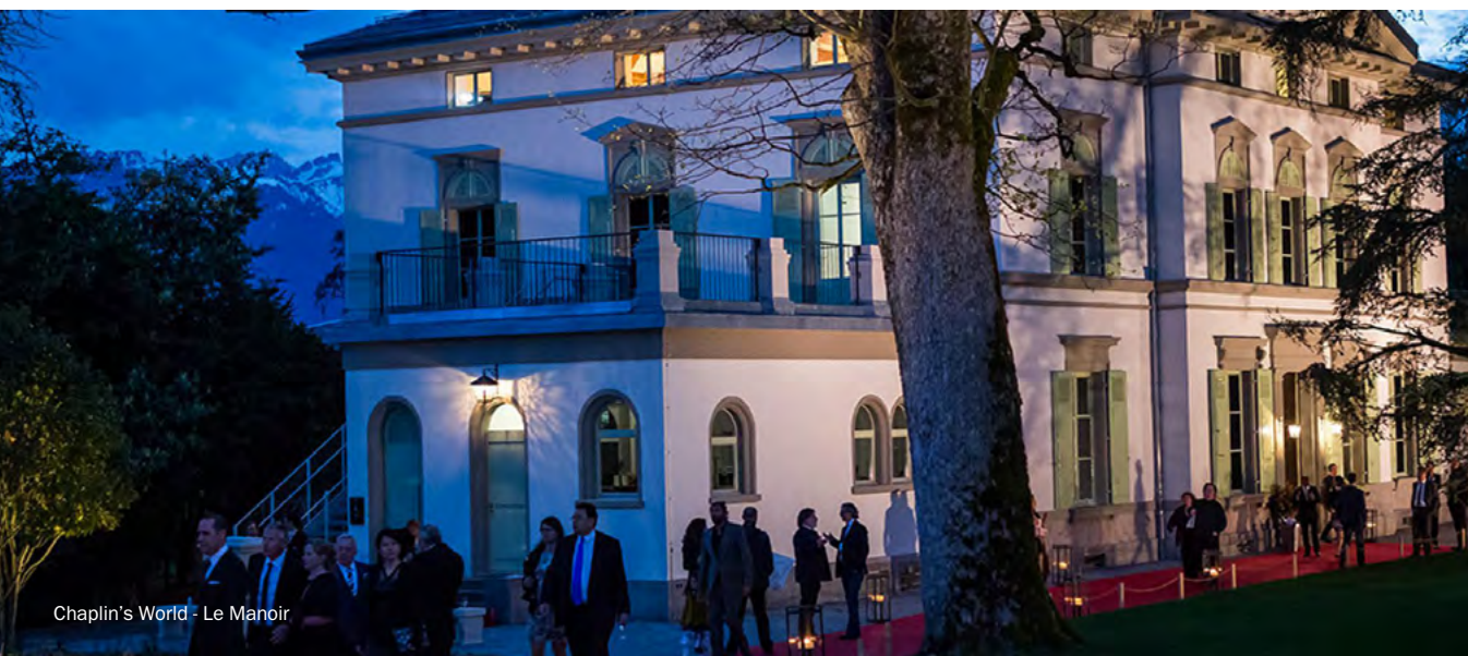
Chaplin's World - Le Manoir