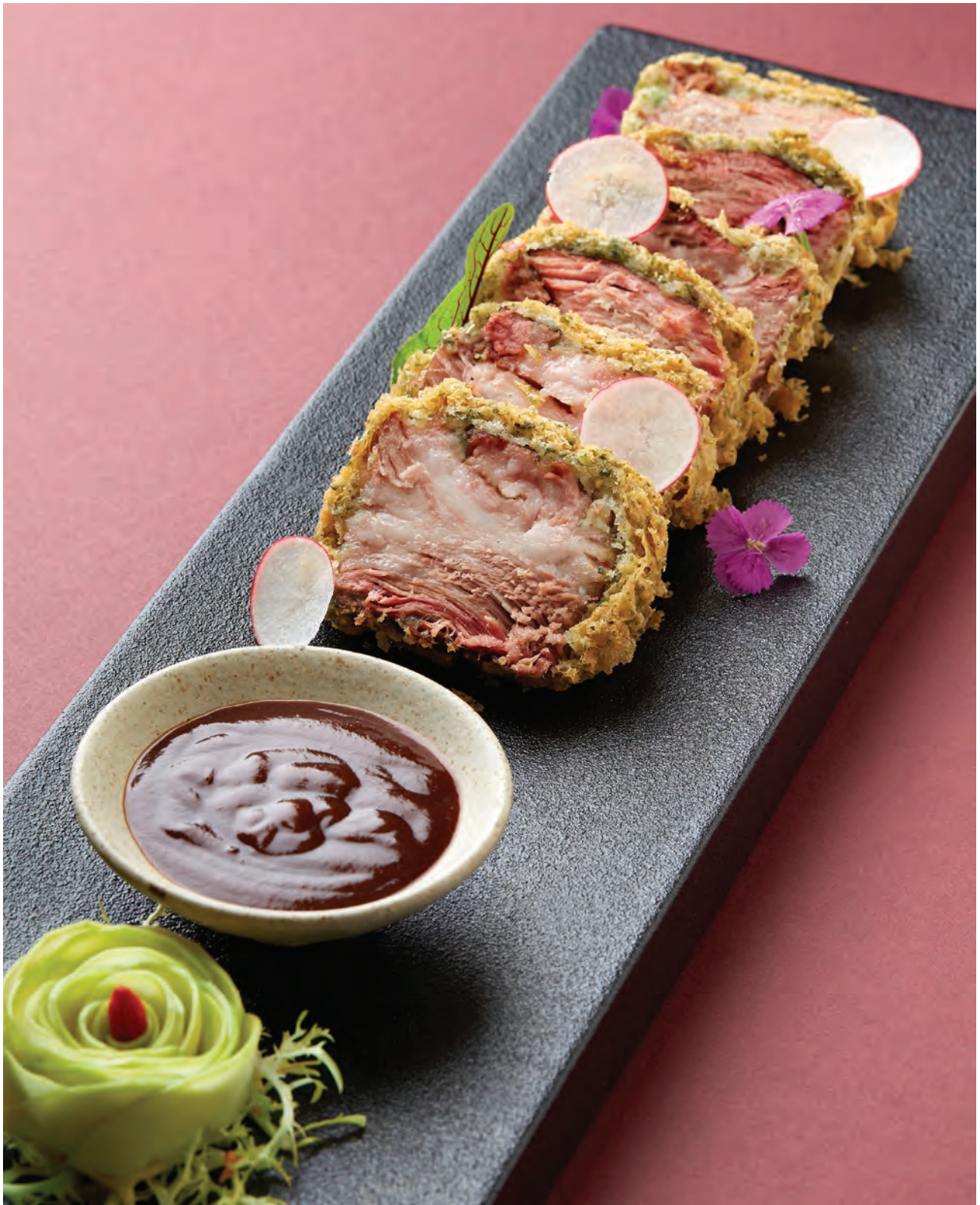
脆皮紫菜伊比利猪柳伴开胃生芒果 (P) 藝。

IBERICO PORK ROLL WRAP WITH CRISPY SEAWEED SERVED WITH PICKLED SLICED GREEN MANGO & HOMEMADE SPECIALTY SAUCE