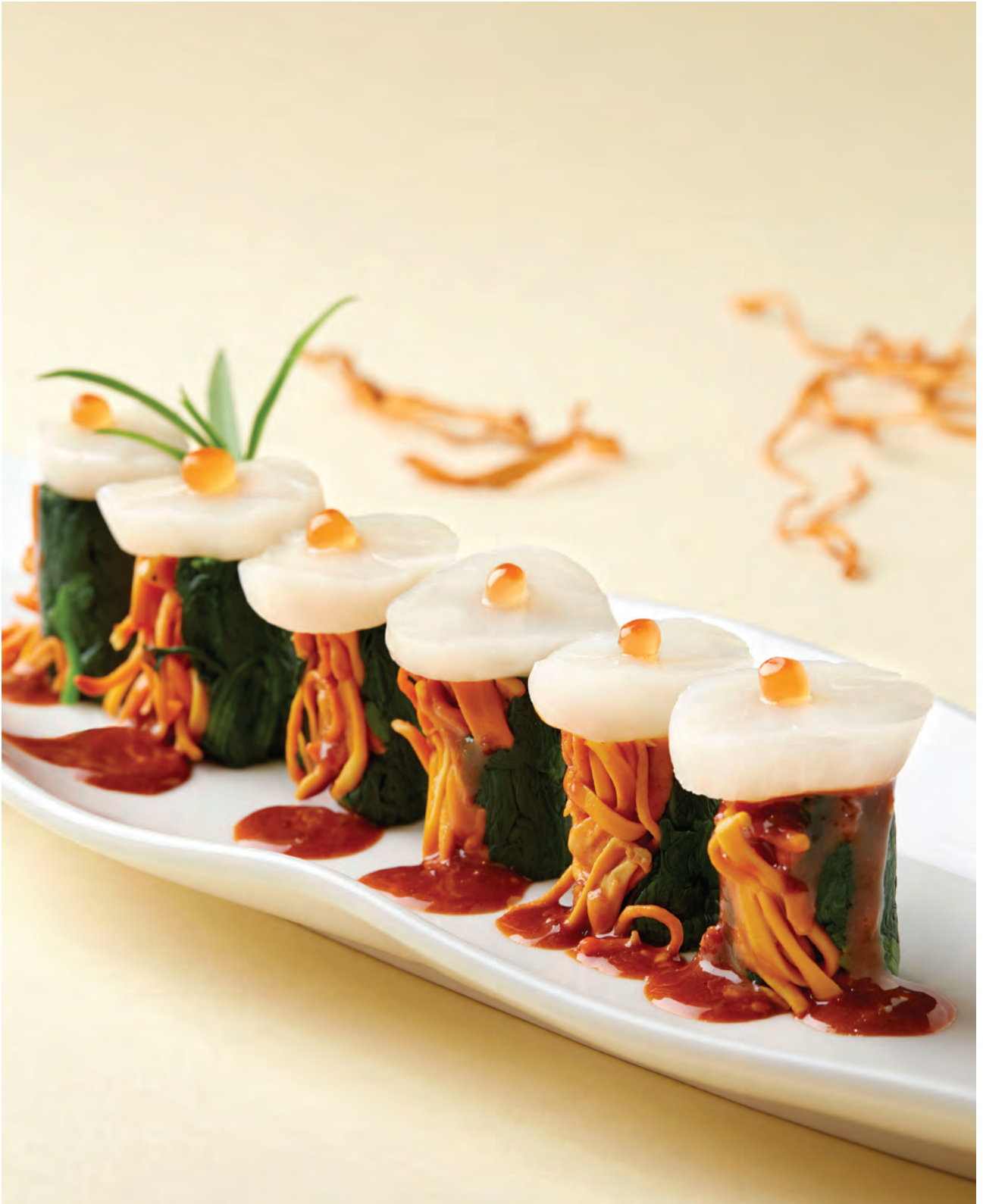
麻酱北海道玉带鲜虫草花菠菜卷 (N) 藝。

HOKKAIDO SCALLOPS ON CORDYCEPS FLOWER & SPINACH ROLLS IN SPICY SESAME SAUCE