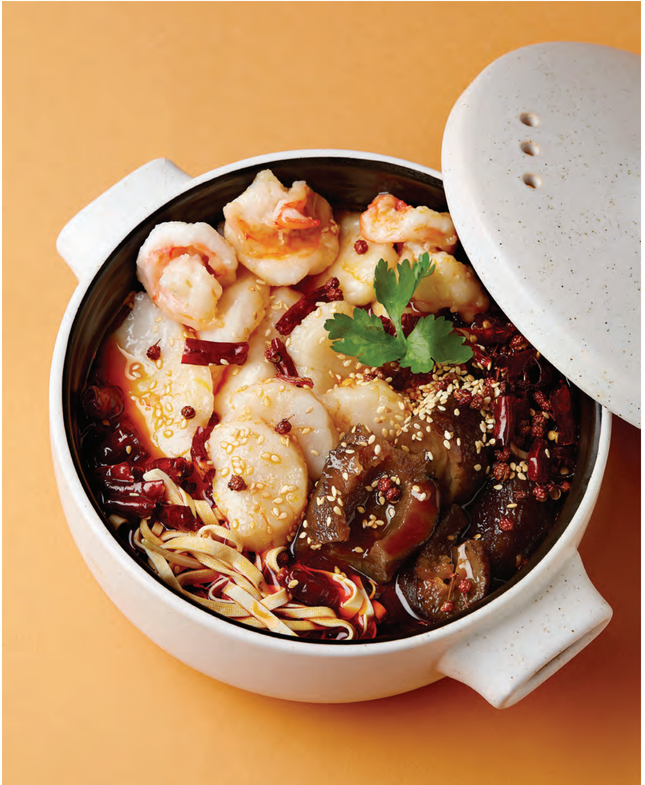
香辣一品海鲜煲 (A) 藝。

SPICY ASSORTED SEAFOOD POT WITH PRAWNS, HOKKAIDO SCALLOPS, SEA CUCUMBER, COD FISH, BEAN SPROUT & BEANCURD SKIN