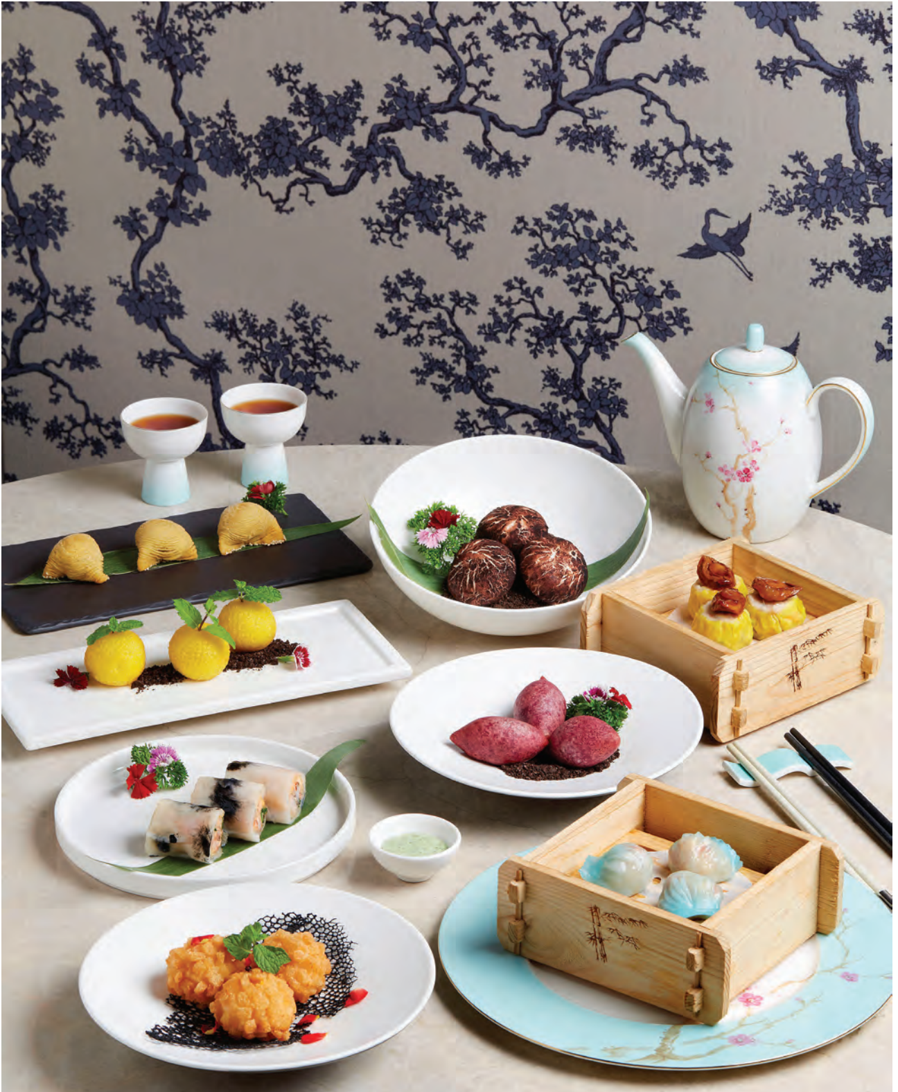
DIM SUM SELECTION IMAGE SHOWN IS FOR ILLUSTRATION PURPOSES ONLY