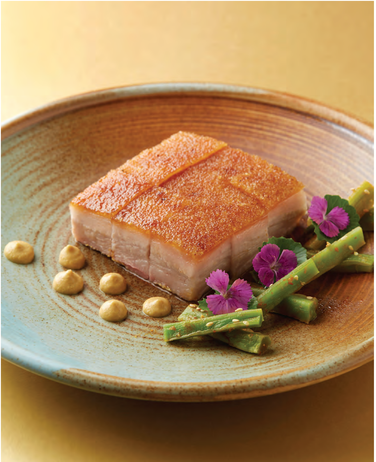
芥末贡菜脆皮火腩 (GF)(P) 藝。

CRISPY PORK BELLY WITH TRIBUTE VEGETABLE & YELLOW MUSTARD